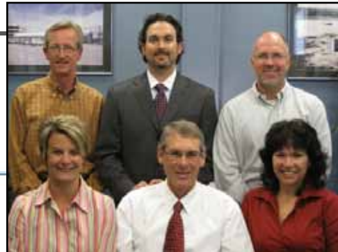
SteelMaster Leadership Team